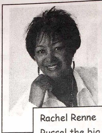
Rachel Renee Russell the big person writing this book!